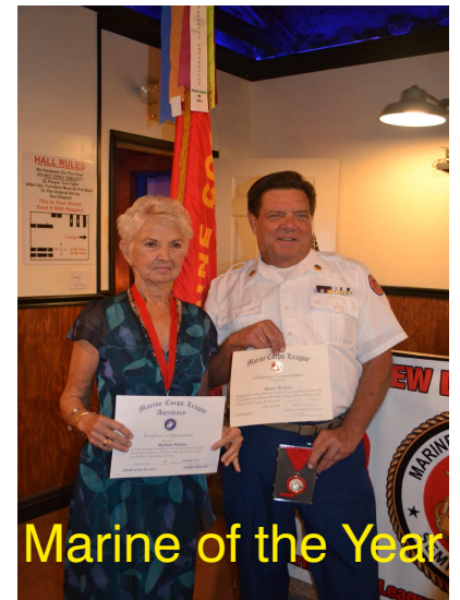
Marine of the Year Aux. Member of the