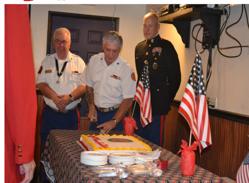
238 th Birthday