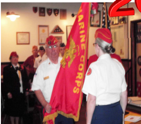
Change of Command