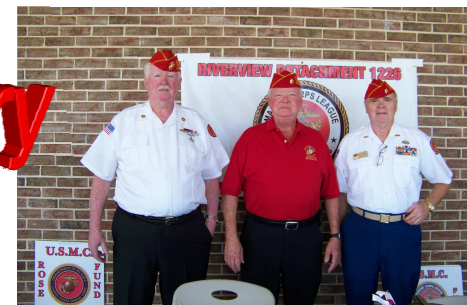
Rose Fund Drive