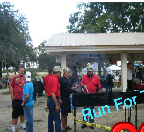
Run For The Fallen