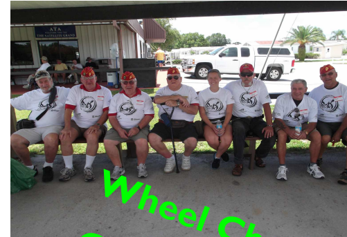
Wheel Chair Games