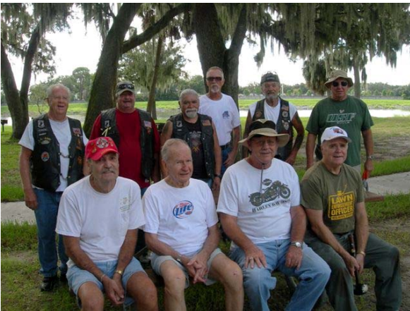
Thank you to the working party at the Field of Honor!