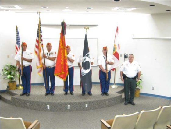
Our Honor Guard making you proud at the Hispanic Heritage Celebration at HCC